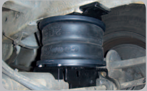
Basic system 1550220100