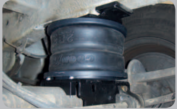
Basic system 1550220100